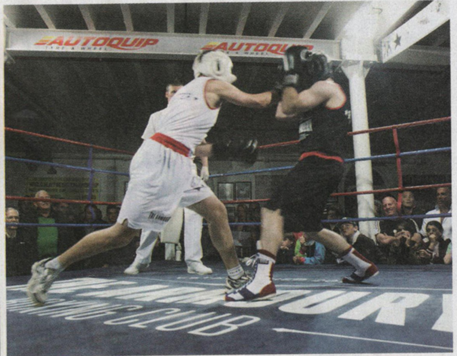
Two boxers tackle each other amid great applause from the crowd. The youngest man to fight on the night was 21.

Boxing Association, he says proudly. And the exercise programme is tough. "Boxing is the best exercise you can get. It's simple but difficult to sustain."