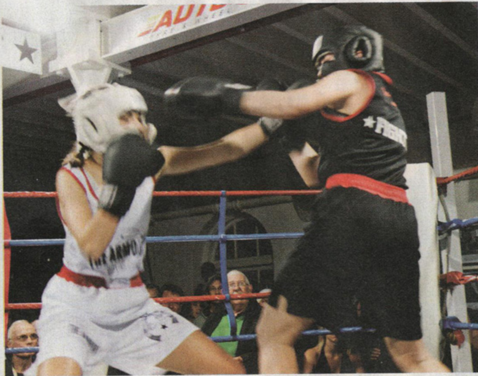
Women also show their mettle in the ring – the youngest was an 18-year-old matric learner. Everyone wears proper boxing attire.